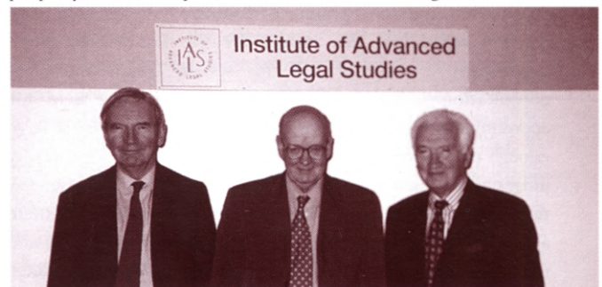
From left to right: the Rt Hon The Lord Nolan, Chairman of the Board of the Institute of Advanced Legal Studies; the Rt Hon The Lord Steyn, President, Advisory Council of the Society for Advanced Legal Studies; and the Rt Hon The Lord Mackay of Clashfern.

At this point I wish to comment on a matter which, at its most extreme, concerns the continuation of particular courts and, in its more minor form, contemplates differentiation between courts. This is the issue of specialisation. In 1978, there was a question in the common law world about the extent to which the work of the courts would be sent out of the courts to specialist tribunals, and I suppose one aspect of this title is concerned with the fact that we have an array of tribunals in the UK which carry out a great deal of work which could be done in the courts. These tribunals often have as their judiciary a professional lawyer as chairman, but with non-lawyers also participating in the decisions. What amount of specialisation in the courts themselves should we have? In the smaller jurisdictions, Scotland and Northern Ireland, the opportunity for specialisation within the court is more limited than in England and Wales. In England and Wales there is a degree of specialisation inherent in the present structure of the High Court, with its three divisions; within the Queen's Bench Division there is the specialised jurisdiction of the Commercial Court. Nowadays, the judges of the Family Division probably specialise in family work as their only work to a greater degree than the judges of the other divisions specialise, save that in the Chancery Division the judges who regularly do intellectual property work also specialise to a considerable degree.