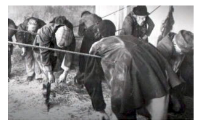
A Victorian two-penny hangover.

an offence within the 1824 Act and could be punished. Various parts of the 1824 Act have been repealed over the years so that, for example, there are now only seven sections remaining (see legislation.gov.uk). A reading of homelessness policy existing in the early 19th century would reveal just how outdated are the values still held today which regard poverty as something of a crime and street homeless people as unworthy of assistance (Aziz 2019; Greenfield & Marsh 2019).