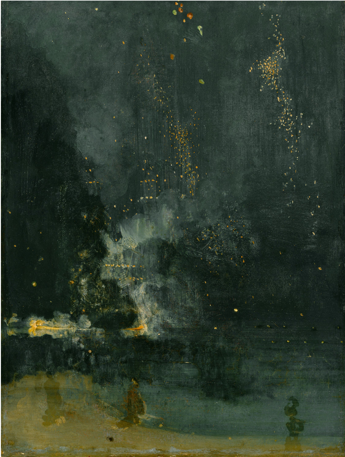
Figure 1: Nocturne in Black and Gold—The Falling Rocket

prompting a broader discourse on the valuation and purpose of art in the Victorian era.